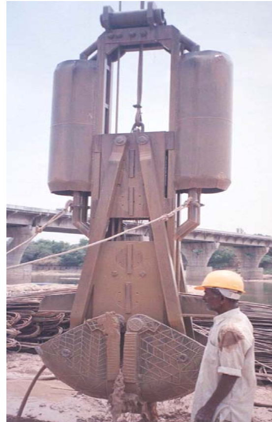
Wire Operated Mechanical Grab