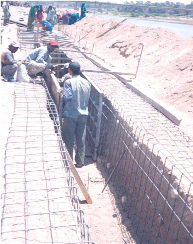
Guide Wall Construction