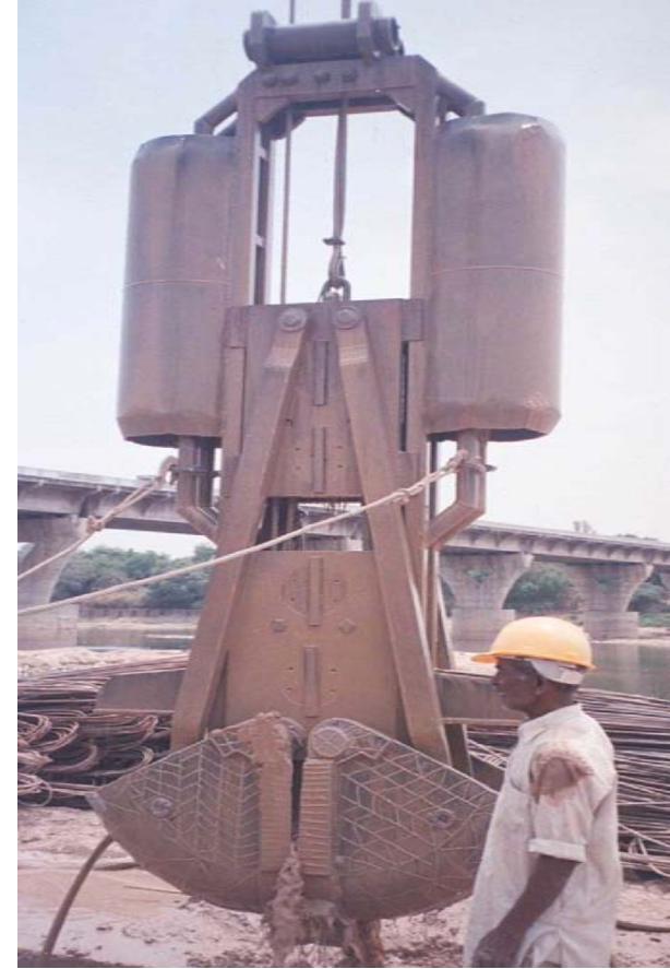
Wire Operated Mechanical Grab