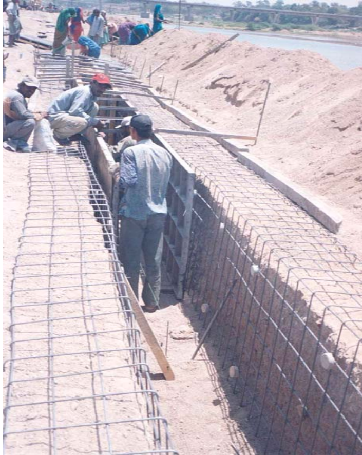
Guide Wall Construction